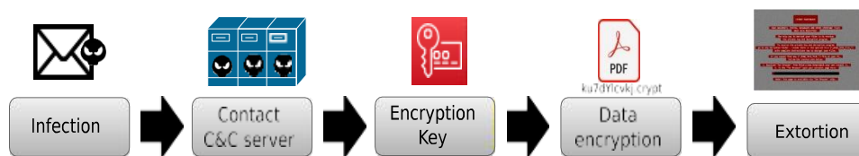
Fig1. Working of ransomware

The basic idea of ransomware was presented in the form of a cryptovirus in 1995. They encrypt victims' files and require user's payment to decrypt them. Because they utilize public key cryptography, the key for recovery cannot be found in the footprint of the ransomware on the victim's system. Therefore, once infected, the system cannot be recovered without paying for restoration. Various methods to deal this threat have been developed by antivirus researchers and experts in network security.