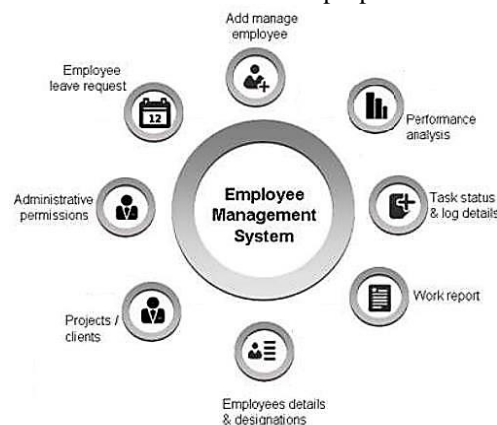
Figure 1: Employee Management system functions

This report's documentation goes through the whole process of both application program and database development. It also comprises the development tools have been utilized for these purposes.