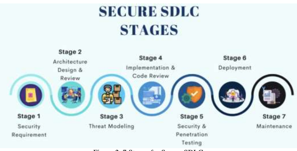
Figure 2. 7 Stages for Secure SDLC

DevSecOps combines development, security and operations, the main focus being to incorporate security concerns into the SDLC process. It accepts the fact that development means security monitoring and testing in parallel to omit large amounts of work being done in the end when it is more expensive in terms of time and budget. Agree and DevSecOps work in harmony where it doesn't only increase the speed of app delivery but also integrate security measures at each step of the process. This paper examines the advantages, prospects, technical approaches and management frameworks in connection with the incorporation of DevSecOps into Agile SDLC, which provide guidance to organizations on how best to optimize their SDLC without having to sacrifice security. In figure 2, we have other phases of secure SDLC.