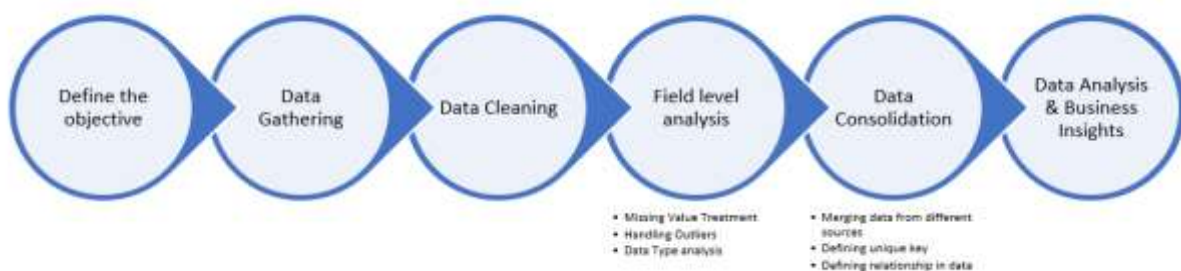
Figure 1 shows the process of data pre-processing and data preparation for visualization.

Figure 1 shows the process of data pre-processing and data preparation for visualization using Python and its repositories. Raw data needs to be structured before exploration and visualization. There are many reasons why data might be missing in a dataset. For instance, data collected through a survey may have missing data due to participants' failure to respond to some questions, not knowing the correct response, or being unwilling to answer. It may also be missing due to the error made during the data entry process.