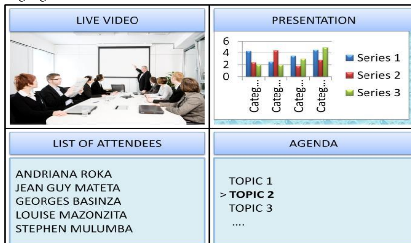
Fig no .1 -Example of user interface for EMS

On-line Conferencing Systems, sometimes referred to as Electronic Meeting Systems (EMS), are Internet-based services offering a virtual environment for real-time remote meetings between geographically dispersed participants. EMS are part of the broader field of Collaborative Internet Systems that encompasses the use of computers and Web technologies to support coordination and cooperation of two or more people attempting to perform a task or solve a problem together. EMS environment offers tools, methods and features to support remote meetings. Some of the common features include slides. How presentation sharing, audio/video communication, shared whiteboard for annotation and text chatting.Fig.1illustrates a common EMS user interface