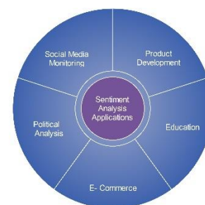
Figure 2: Real world applications of Sentiment Analysis.

Opinion analysis is also used in healthcare to analyse patient feedback, education to evaluate student opinion, and finance to forecast market trends. SA has variety of applications in real world including social media monitoring, product development, analysis of political situations, education, finance and e-commerce. It is also applicable in healthcare sector in gauging patients' feedback and identifying the areas of improvement. SA may be used in financial services to analyse customer reviews and discover problems with financial possessions and services. It may also be used to analyse finance-related social media conversations and determine public opinion towards financial institutions and legislation. It may be used in e-commerce in order to detect product service flaws and enhance customer experience. Figure 2 represents some real-world applications of SA.