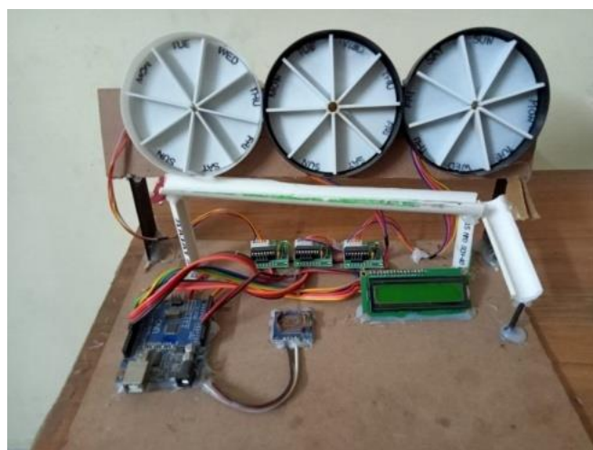
Figure: Smart Medicine Box

In our smart medicine box, we form a cylindrical shape as a base and our circuit has majorly two circuits one is digital alarm clock and other one is a connection of three stepper motor with Arduino which dispense pill automatically. Our smart medicine box is a cylindrical shape box divided into three sections with respect to morning, afternoon and evening. These three sections are divided into eight sections one is used as a initial point and rest are used for week days.