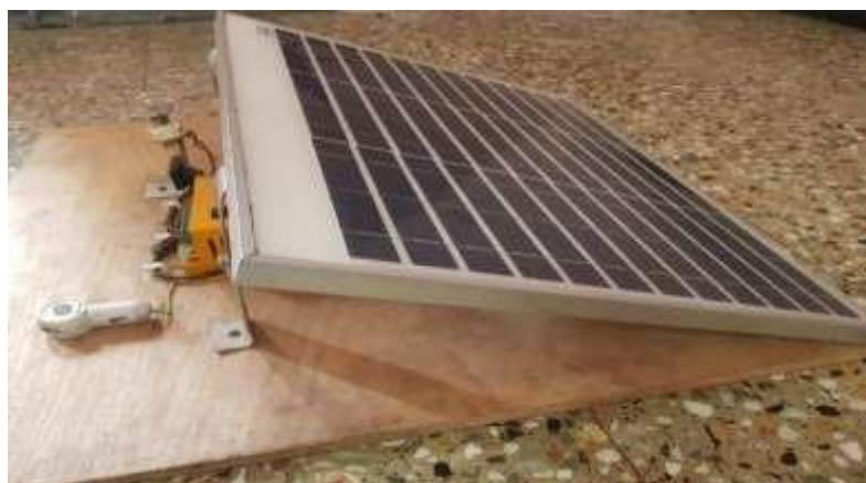
Fig.9. Actual Model.