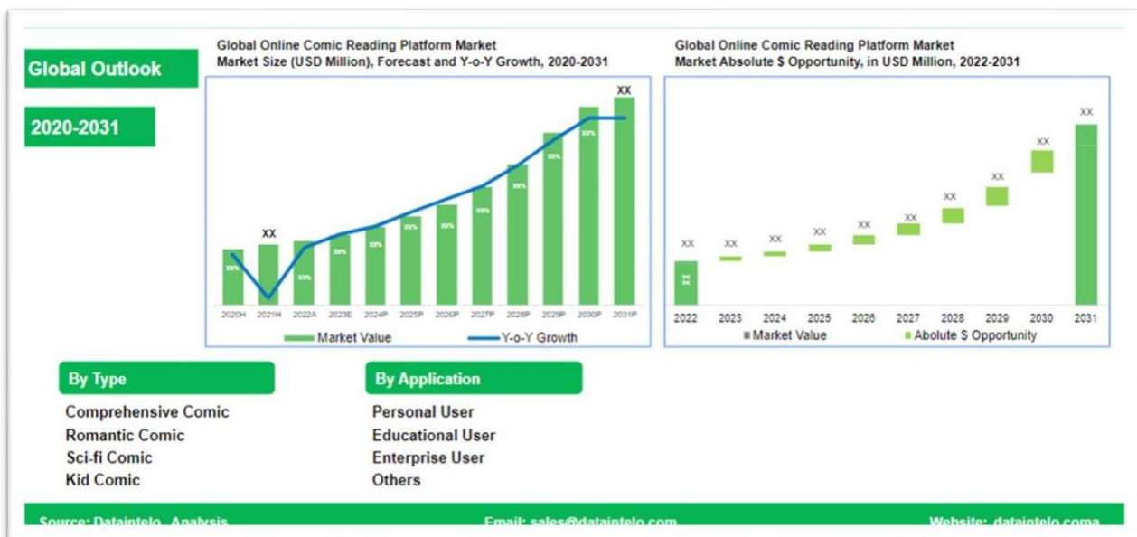
Fig.1.1 Global Online Comic Reading Platform Market Size & Forecast

Graphs that represent the use and growth of Web Comics: [5]