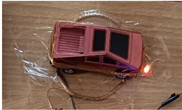
Fig. 3: Output of an Image