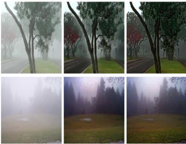
Figure 3: (a) Original foggy image (b) Defogged image (c) Wiener defogged image

Wiener filtering [4] is used to counter the problems such as color distortion while using dark channel prior when the images with large white area is processed. While using dark channel prior the value of media function is rough which create halo effect in final image. So, median filtering is used to estimate the media function, so that edges can be preserved. After making the median function more accurate it is combined with wiener filtering so that the image restoration problem is transformed into optimization problem. This algorithm is useful to recover the contrast of a large white area for image. The running time of image algorithm is also less.