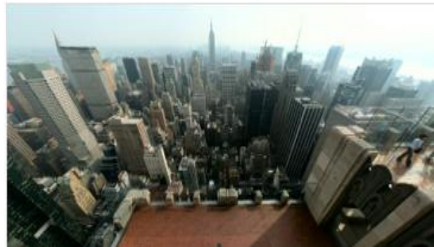
Figure 2: (a) input image