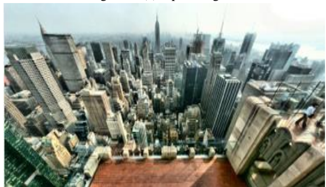
Figure 2: (b) output image