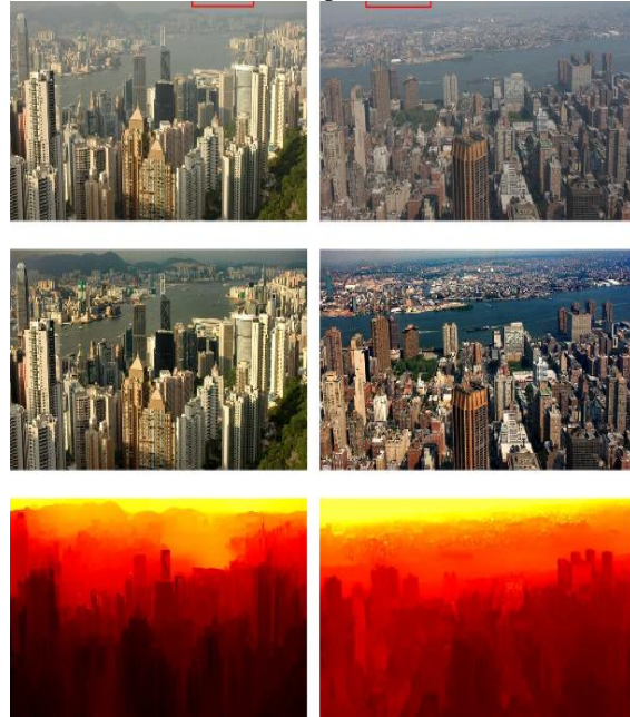
Figure 1: Haze removal results. Top: input haze images. Middle: restored haze-free images. Bottom: depth maps.

component is processed by CLAHE without effecting hue and saturation. This method use histogram equalization to a contextual region. The original histogram is clipped and the clipped pixels are redistributed to each gray-level. In this each pixel intensity is shortened to maxima of user selectable. Finally, the image processed in HSI color space is converted back to RGB color space.