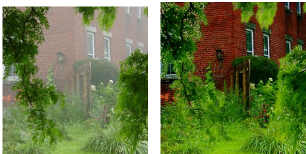
Fig 1.1: (a) Original image (b) Processed image (adapted from [1])

Visibility restoration [1] refers to different methods that aim to reduce or remove the degradation that have occurred while the digital image was being obtained. The degradation may be due to various factors like relative object-camera motion, blur due to camera misfocus, relative atmospheric turbulence and others. In this we will be discussing about the degradations due to bad weather such as fog, haze, rain and snow in an image. The image quality of outdoor scene in the fog and haze weather condition is usually degraded by the scattering of a light before reaching the camera due to these large quantities of suspended particles (e.g. fog, haze, smoke, impurities) in the atmosphere. This phenomenon affects the normal work of automatic monitoring system, outdoor recognition system and intelligent transportation system. Scattering is caused by two fundamental phenomena such as attenuation and airlight. By the usage of effective haze removal of image we can improve the stability and robustness of the visual system.